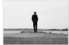
The Danger of a Life of Pleasure

Then in verse 14, it is expanded. It is almost as if he writes a little commentary on what it means. He says, "I write to you, young men, because you are strong, and the word of God abides in you, and you have