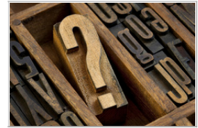
How Shall We Escape If We Neglect So Great a Salvation?