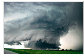
Judgments, A Call to Repentance