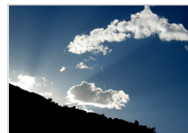
Heaven is a World of Love, by Jonathan Edwards

Audio recordings of history's greatest sermons